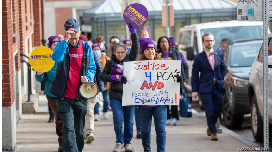
Community members march to the state house to demand dignity for personal care attendants.

Southard is just one of thousands of people with disabilities across the