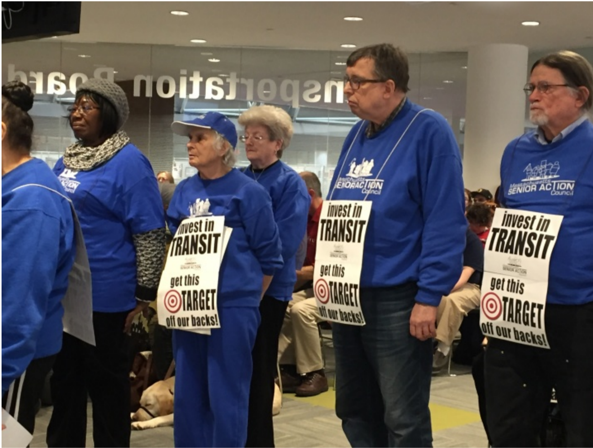
Members of the Massachusetts Senior Action Council protest at the T oversight board meeting.

TRACKING TRANSPORTATION / TRANSPORTATION