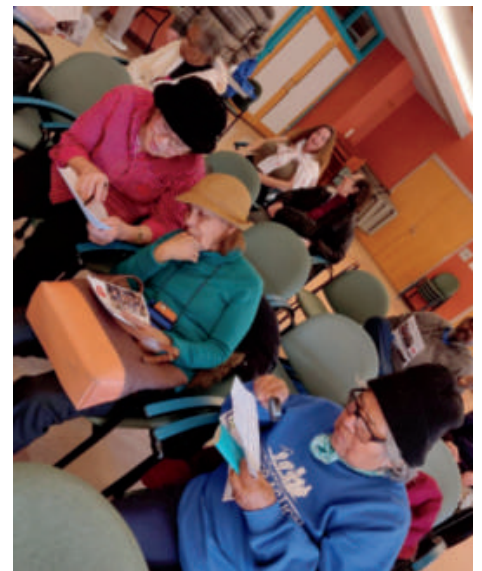
MSAC members hone their lobbying skills

MSAC wants to hear from you. See above how this increase will impact riders and let us know what you think. Can we achieve FAIR FARES FOR ALL?