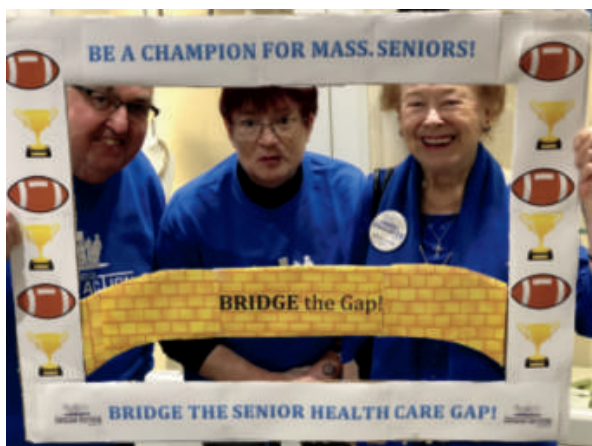
Bristol members say Bridge the Gap! Be a MSAC champion!