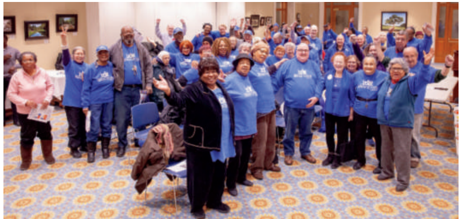
MSAC members chant "Bridge the Gap!" at State House Elder Lobby Day

MSAC members should celebrate this huge achievement, but the fight is not over for those who want to "Bridge the Senior Healthcare Gap."