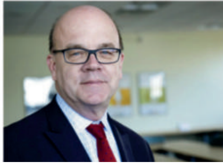
Clockwise from top left: Sen. Elizabeth Warren, Rep. Richard Neal, Rep. Jim McGovern, Rep. Katherine Clark

As Vice President Mike Pence swore in the new Democratic majority at the U.S. House of Representatives, Massachusetts's voters watched their influence grow. Several members of the Massachusetts delegation took on new influential positions in the new 116th Congress.