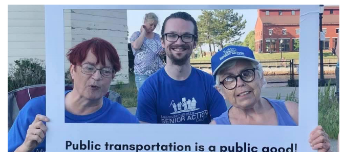
Bristol County Chapter Members at New Bedford Rally

The journey to get the Fair Share Amendment on the ballot in 2022 has been long and arduous, beginning back in 2015. Then the Fair Share Amendment struck a notable victory in June of 2019 when the first Constitutional Convention of Massachusetts voted 147-48 in favor of advancing the Amendment to the ballot. Then on June 9th 2021, as procedure dictated, the second Constitution Convention of Massachusetts re-confirmed the advancing of the Fair Share