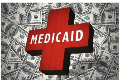
measure just how effective the proposed waivers will be.

While MassHealth agrees that the policy is fraught with injustice (which is why they have proposed a set of new waivers to alleviate the most vulnerable). MSAC subcommittee members remain concerned about who may be left out of the new waivers and the injustice of the policy in general. MassHealth has yet to provide any data on who exactly will be relieved by the new waivers despite multiple requests, leaving it difficult to