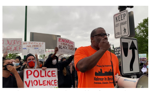
Above: People rally for Police Reform in Boston.

Another provision that advocates had called for an end to was No-Knock Raids, which this bill addresses by disallowing No-Knock raids if there are children or seniors within the residence. This legislation also establishes the duty of officers to intervene if they see another officer using unnecessarily deadly